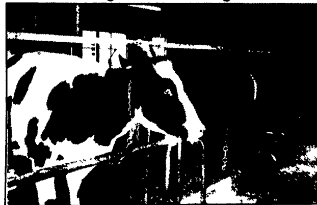
Young Cows Pushing Hard

Fantasia freshened at 1 yr. 9 mos. in Oct., bred right back to freshen again in Sept., & at 185 days had a projected record of 18,771 of milk and 629 of fat. She peaked at 99 lbs. David credits Brown's Prolac Pellets fed as a topdress to individual high producing cows with helping several heifers approach the 100 lb. mark this winter. Herd reproductive performance and body condition have both improved since switching to BROWN'S FEEDS.