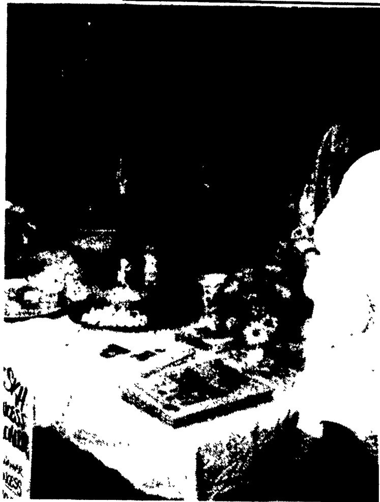
In-store dairy promotions usually include free samples of milk punch, dip, sometimes yogurt, informational publications and coloring books. Angie Spichler prepared vegetable dip for patrons at Stauffer's of Kissel Hill.

Through this variety of effort, June has seen cow milking contests at baseball games, dairy food give-aways, ice-cream samples in well-known public places, free