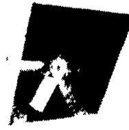
Wall Fan w/Hood & Painted Galv. Cabinets