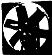
Belt Drive Panel Fan

All Types Of Fans For All Types Of Buildings