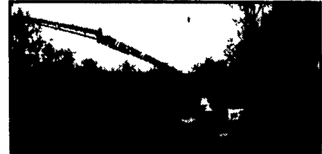
92' Boom Placing Concrete