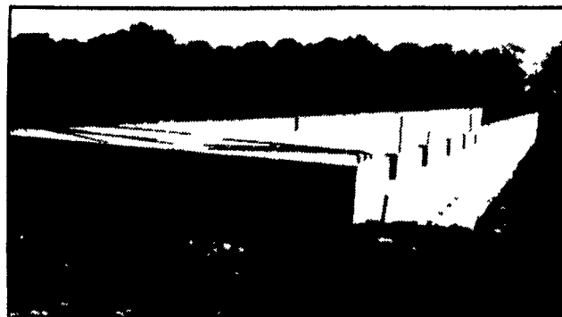
300' Long Manure Pit For Hog Confinement