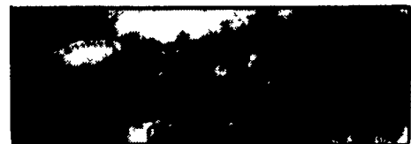
Mixer And Boom Trucks