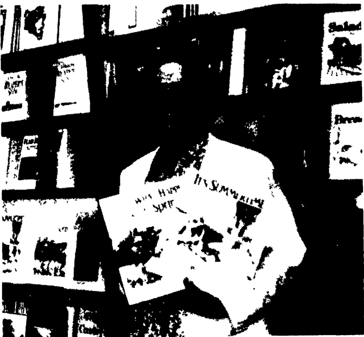
Elaine Good shows off the two books she has written in response to watching her children grow up on the farm.