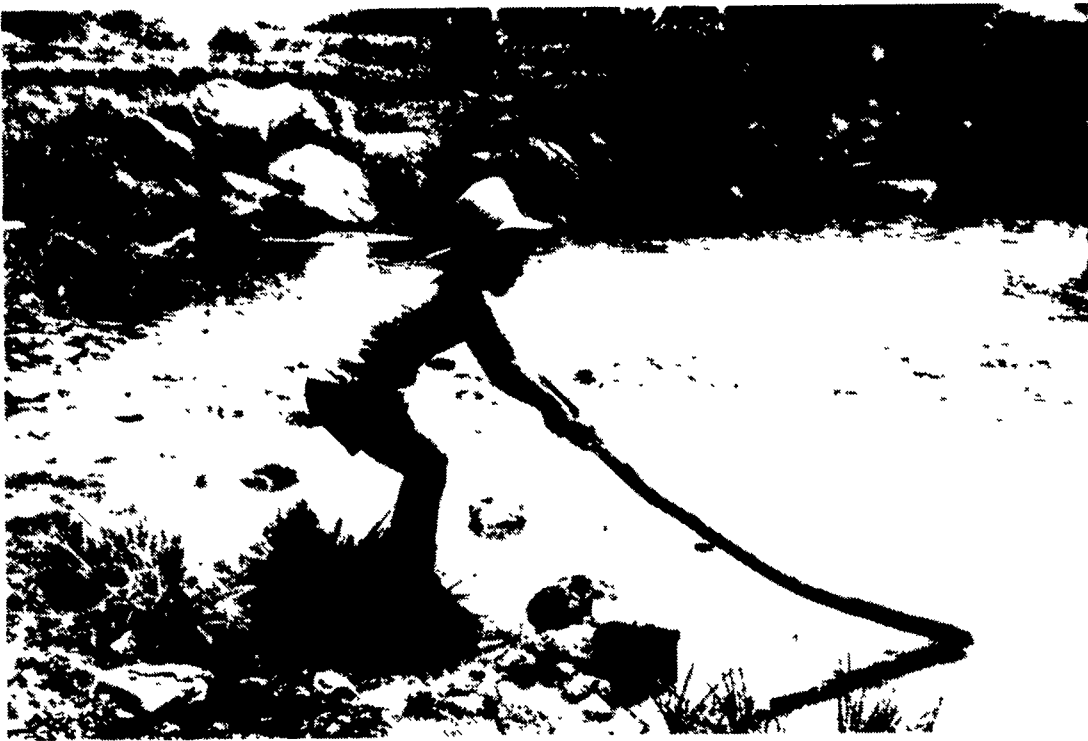
Daren plays in the Hammer Creek that slices through their 115-acre farm in Lititz.

The books are written for ages 3 to 8, and both can be purchased at local bookstores or by calling collect if you live in Pennsylvania (717) 768-7171. If you live outside Pennsylvania, call 1 800 762-7171.