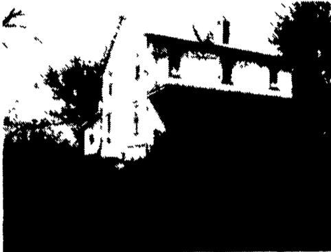
4-BEDROOM DWELLING, Oil Hot Water Heat, Bath