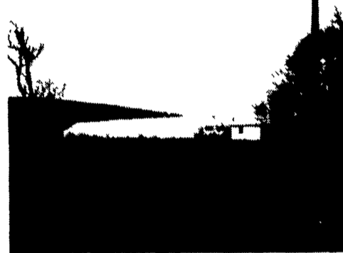
65 Ft. x 128 Ft. HYDROPONIC GREENHOUSE Dual Heating System

40 Ft. x 100 Ft. Block Shed w/14' Doors Part used as Shop Area has Oil Hot Air Heat