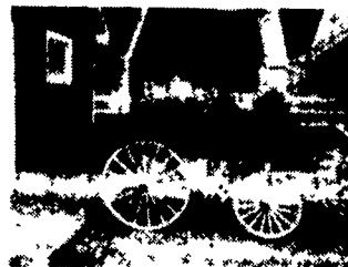
PONY HITCH WAGON