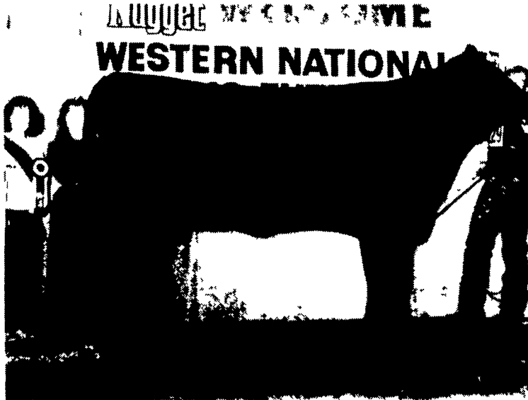
The reserve junior champion female ribbon at the 1990 Western National Angus Futurity went to Northcote Norene. She is owned by Northcote Farm, Forest, Virginia; Fox Hill Farm, Unionville, Pennsylvania; and Oklahoma State University, Stillwater.