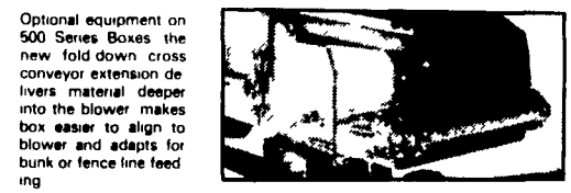
Optional equipment on 500 Series Boxes the new fold down cross conveyor extension delivers material deeper into the blower makes box easier to align to blower and adapts for bunk or fence line feeding