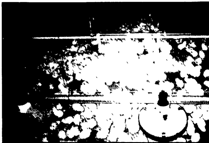
Pennsylvania's Most Popular Broiler Feeder! Chore-Time's H2 System, With Chick Starting Windows On Top Of The Cone, And Chore-Time's Reliability Get Birds Off To A Quick Start Without Excess Waste.

The Pal-Tech computer controlled natural ventilation system saves electricity by eliminating power ventilation fans and inlets and by replacing energy leaking curtains with insulated sealed panels. The Pal-Tech computer controlled natural ventilation system takes advantage of warm contaminated air's natural tendency to rise to the peak of a building. The computer opens various combinations of Pal-Tech ridge vents and wall vents to purge the house of contaminated air and control humidity and ammonia. It can cross-ventilate (end-to-end) to balance temperature and keep the entire building supplied with clean, fresh air. The grower simply enters target settings and since he has no fans, inlets, brooders, space heaters or curtains to adjust, this large, naturally ventilated building takes less labor than smaller conventional houses one third the size.