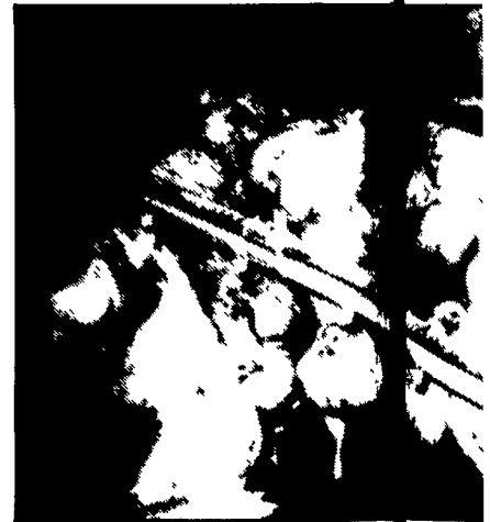
Val Nipples With Val Mini-Drinkers Provide Fresh, Uncontaminated Water And Access.