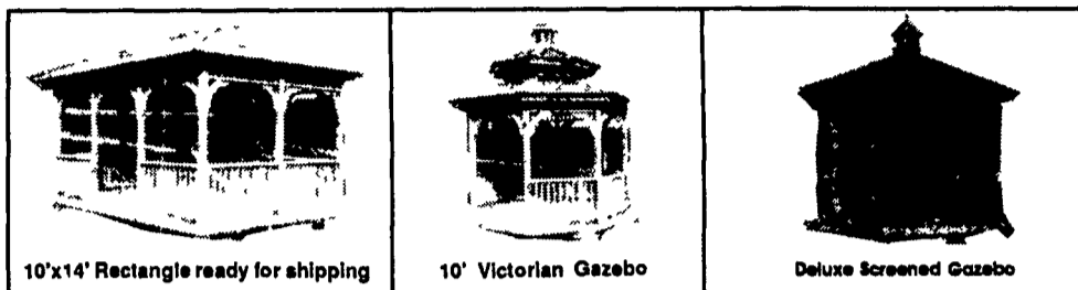
10'x14' Rectangle ready for shipping

Cedar Lawn Furniture & Redwood Lawn Furniture Available