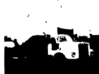
34 FT. TANDEM AXLE VAN DUMP TRAILER, Good For Hauling Saw Dust Or Wood Chips, w/ or w/out Tractor.

Used Truck Parts Gas and Diesel Motors Rears and Transmissions Tires Of All Sizes