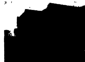
NEW and USED Dump Bodies Of All Sizes, 20 To Choose From.

MORE THAN 350 TRUCKS ON LOT AT ALL TIMES USED TRUCKS OF ALL TYPES - GRAIN BODIES - REEFER - DIRT DUMPS TRUCK TRACTORS - SINGLE AXLE- DRY & REF BODIES, NEW & USED STAKE AND DIRT DUMP BODIES OF ALL SIZES- (We Buy, Sell & Trade) USED TIRES, WHEELS, OF ALL SIZES - USED TRUCK PARTS AND MOTORS - GAS AND DIESEL