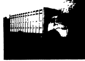
1977 C600 FORD NEW REBUILT MOTOR PS, w/16' Alum. Cattle Body, Truck Just Completely Rebuilt.