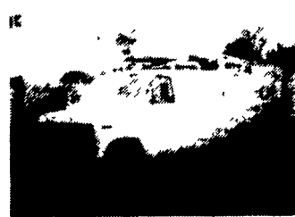
1981 E350 FORD Auto, PS, Electric Hydraulic Bucket Truck. C700 Ford w/34 Ft. Aspundh Bucket Truck