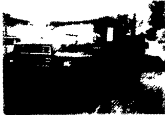
1981 F800 FORD P/S 5+2, Central Hydraulics, Low Mileage, 9 Ft. Dump, Gas or Diesel, 25 Single Axle Dump Trucks Of All Sizes