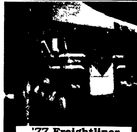
'77 Freightliner 290 Cummins, 10 speed, 24 radial rubber $2,400 717-532-8926

WANTED: One set of truck scales. Big enough to weigh tractor and trailer. Reply to Box B-1, Lancaster Farming, P.O. Box 609, Ephrata, PA 17522