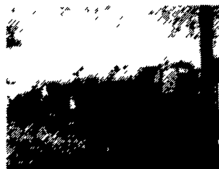
SS TANKS and Alum. Tanks, Trailers and or Tanks For Straight Trucks.