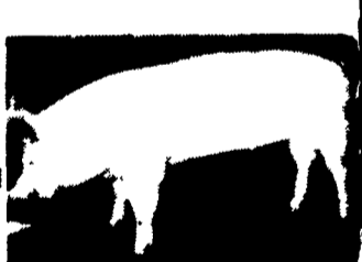
1987 N.Y. Test Station Winner Index 155: Feed Efficiency 2.2: Daily Gain 2.42#/day.