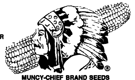
MUNCY-CHIEF BRAND SEEDS

C.E. SAUDER & SONS MILL, EAST EARL, PA PHONE 215-445-4822