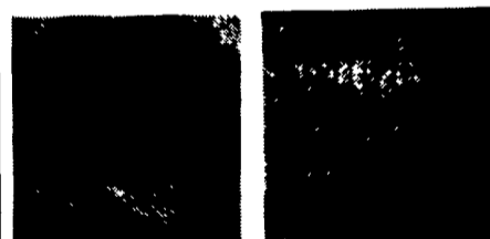
Cement Slabs 5'x20' Reinforced Heavy Duty Pallet Racking & Shelving