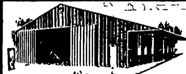
Customized (Many Options Available)