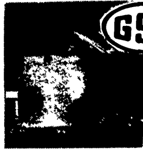
EASY ACCESS WALK-IN DOOR