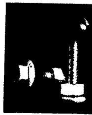
HEAVY DUTY SIDEWALLS High Strength Bolts

GSI EXCLUSIVE EXTRUDED LIP: Protects Against Roof Vent Leaks