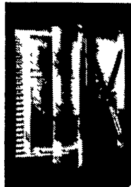
EASY ACCESS WALK-IN DOOR

Also Available For Air Drying Computerized Aeration Monitor