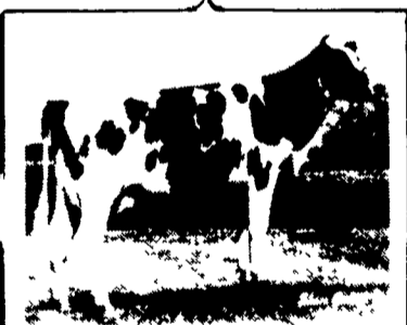
Dtr: Bar-Lee SW Joky VG-85 2-02 2x 309d 20980M 3 2% 668F 3 1% 642P Sandy Dale Farms, Ltd., Dover, OK

SOUTHWIND Should Work Well on Daughters And Granddaughters T. JASON, ROTATES, IJONS, SEXATION, C. STEWARTS, MARK