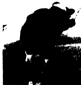
SOUTHWIND BELL OF BAR-LEE

+1026 T.P.I. +2.30 P.T.A. Type +1.24 Udder Comp. +1.87 Feet & Leg Comp. 78% REL (HA)