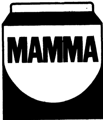
Middle Atlantic Milk Marketing Assoc.

JD 4440 cab and air, nice. Motor has extra blow-buy, $18,000. JD 4840 cab and air, motor does not run, $17,000. (717)423-6719.