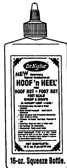
16-oz. Squeeze Bottle.

FOR HOOF ROT • FOOT ROT FOOT SCALD FROM Dr Naylor DR. NAYLOR HOOF 'N HEEL®