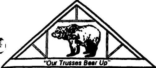
"Our Trusses Bear Up"

Pole Building Specialists Myerstown, PA (717) 933-8294 Quality - Our Goal