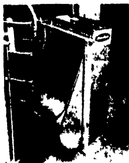
MoorMan's Sow Feeder. Quick to install. Simple to fill. Tips out for easy cleaning.

The MoorMan's Sow Feeder protects your sow from harmful cuts, scrapes and punctures. No sharp edges to cut her. No jutting corners to gouge her. Everything rounded and smooth for safe, comfortable feeding.