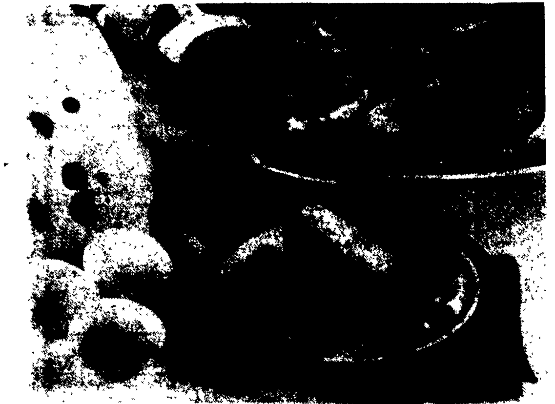
Surprise your mother with this breakfast.