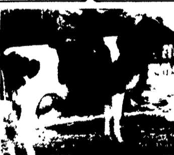
Zum Berge Dotty Bossir R Dana

+ 762 T.P.I. + 1.26 P.T.A. Type + .61 Feet & Leg Comp. 76% REL (HA)