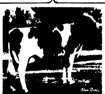
Bossir Judgement-ET Albers

TRADITION X VALIANT aAa - S46 Open Rib, Strong $12 00 Per Unit