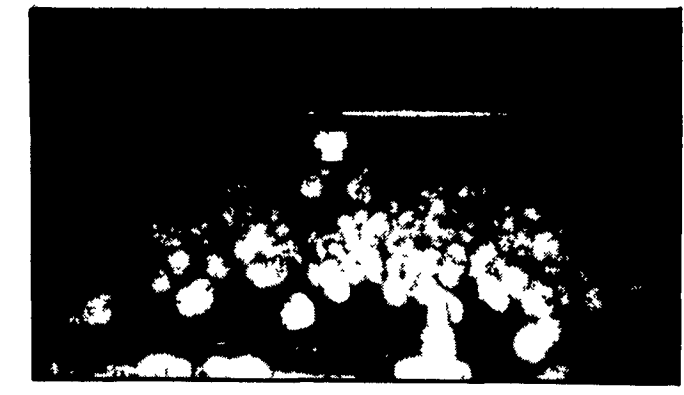
Fills The Pan And Puts The Right Amount Of Feed On The Floor Without Excess Waste