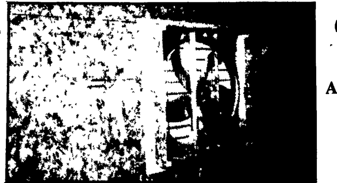
HP Fan Has An Automatic Belt Tensioner And Is Energy Efficient