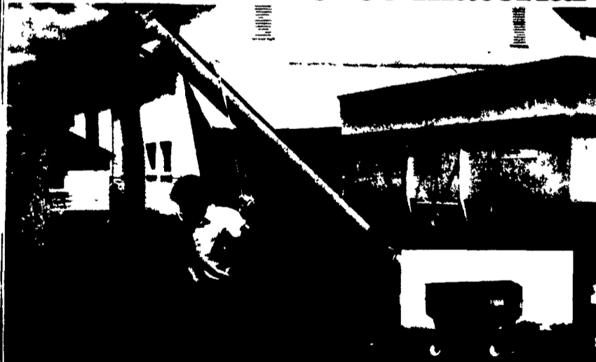
Unverferth grain box augers put material where you need it - fast.