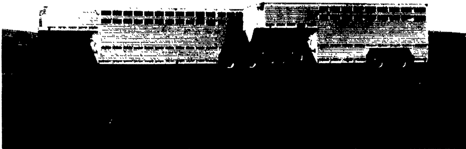
24 foot Ruff Neck trailer on left is Eby's workhorse. Trailer on the right is an economical, 16 foot Wrangler.

M.H. EBY, INC. P.O. Box 127 Blue Ball, PA 17506 (717) 354-4971