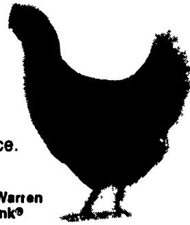
DEKALB Warren Sex-Sal-Link®

Proving herself year after year under varying conditions. High performance.