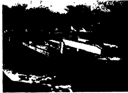
1960 Ottawa 25 Ton Lowboy Trailer 15' Flat, 7' Over Tires, 5' Beavertail, Ramps, 28" High, 8.25x15 Tires.