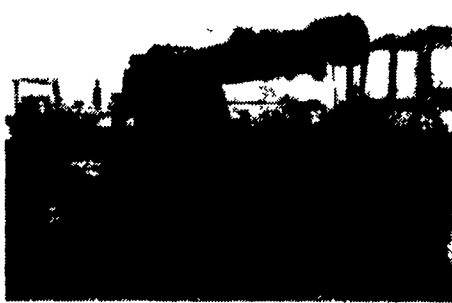
1954 Pettibone 27C Yard Crane, 6 Cylinder Chrysler Gas, 5 Ton Capacity, 16' Reach, 180' Swivel, 10x20 Tires, Only 1641 Hours, Has Been Setting And Never Used Much.