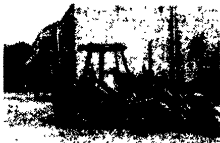
1986 Case 580E 4WD Tractor Loader Backhoe, 1000 Hours, Original Paint, ROPS, Looks And Operates Very Good.

NIGHTS PHONE 717-866-7147 OR 717-273-9089