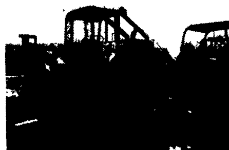
1980 John Deere 440C Log Skidder, ROPS, New Paint, Runs Good.