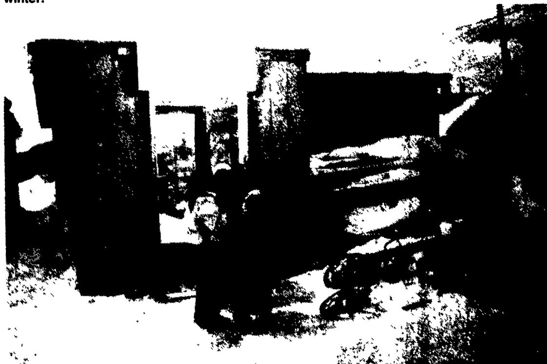
Children in Barrow, Alaska, chat in the half-light of evening. Alaska's long, dark winters produce many people who suffer from seasonal depression, an ailment linked to light deprivation.