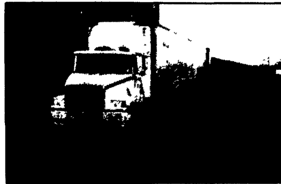
Our trucks deliver to your farm