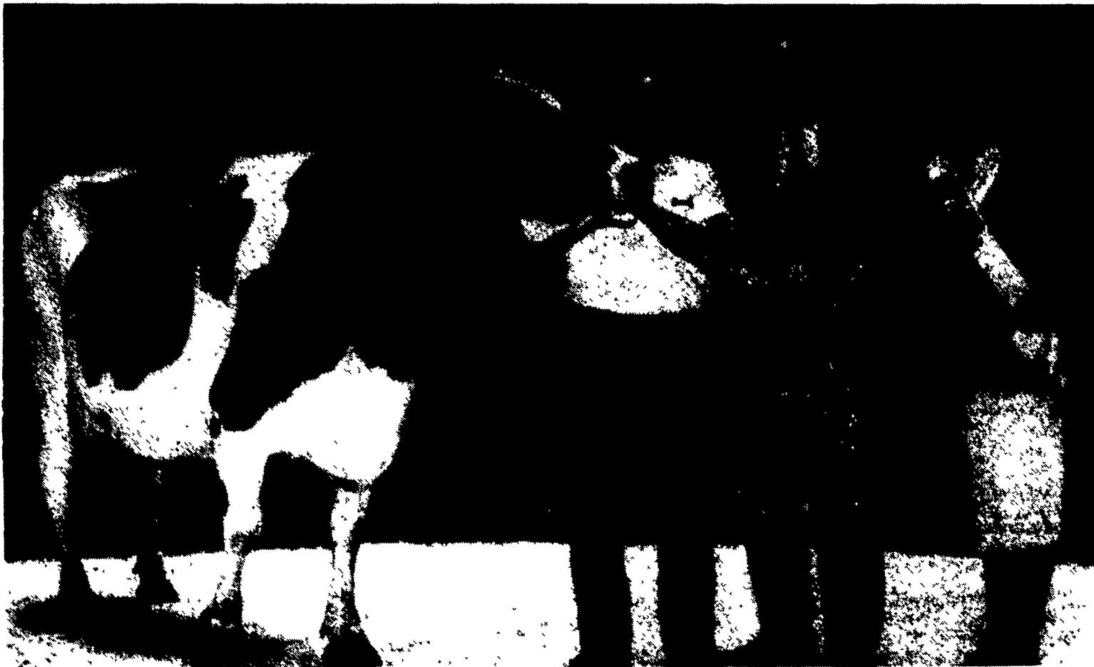
The supreme champion dairy cow for the 1990 Pennsylvania Farm Show was Gor-Wood-D Persuading Favor, a Plushanski Persuader daughter rated as EX-90. At her hal-