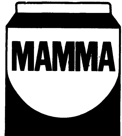
Middle Atlantic Milk Marketing Assoc