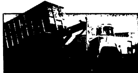
Our trucks deliver to your farm

We Are The Major Philadelphia Distributor Of Baled, Shredded Old Newspaper And Magazines For Use As Animal Bedding