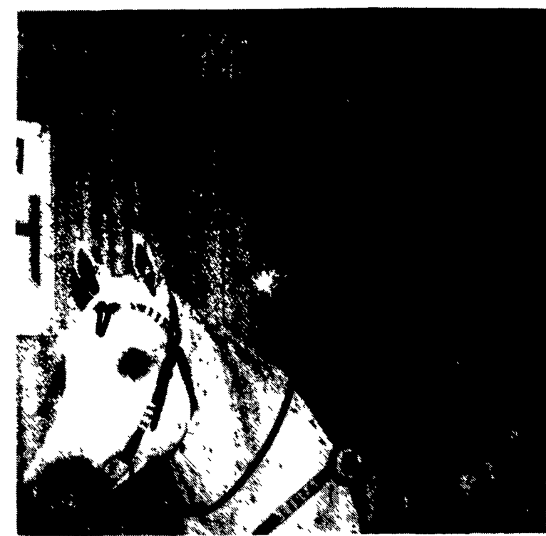
Allson Farrington of Lititz placed first in Western pleasure three-year-old—futurity; third in stock seat equitation, senior division; and seventh in the open trail contest.