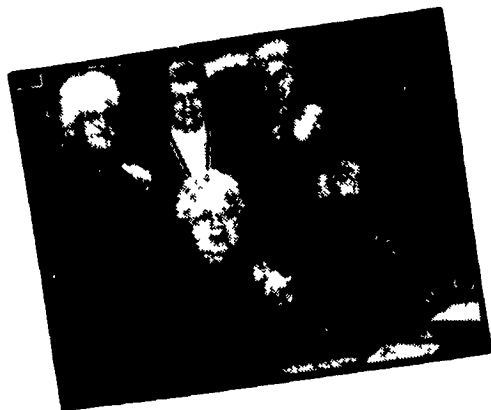
PENNSYLVANIA FARM SHOW Harrisburg, PA