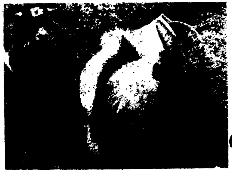
The Stauffers purchases their first two African Pigmy goats to trim around the farm pond. They fell in love with them and today have 25 of the goats. One has earned a permanent grand champion buck status and is now used only for breeding purposes.