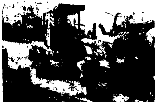
Allie Chalmers "D" Grader, Gas Powered, Hydraulic Leaning Wheels, ROPS

HOURS: MON-FRI 7:30 To 5:00 SAT 7:30 To NOON