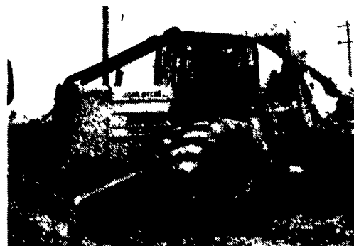
1979 JD 640 Grapple Skidder With Winch, Flotation Tires, Power Shift, Needs Engine Work.