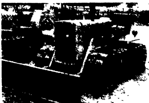
1959 John Deere 440 Dozer, Well Above Average, Very Clean Throughout, Good Collector Or User Machine.