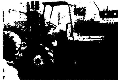
IH 2400 Gas Forklift, 14' Mast, As Received, Not Running, No Time To Play With It.