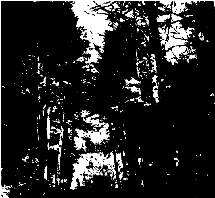
The 13 acres of virgin hemlocks just across the road from the Oberlin home probably appear today much as they did in the 1790s when D. William Oberlin's great-great-grandfather hunted timber wolves there.