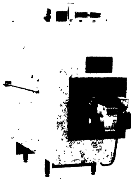
(Rear view of multifuel boiler)