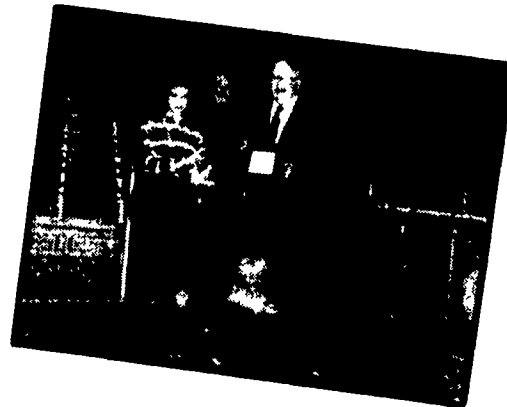
SUNDAY-FRIDAY JANUARY 7-12 1990