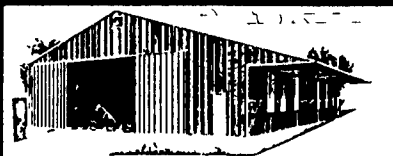
Customized (Many Options Available)