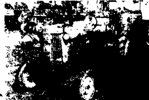
1955 John Deere 40, Wide Front, 3 Pt., Runs OK, Overall Fair Condition. Priced To Sell $1,900

HOURS: Mon.-Fri. 7:30 To 5:00 Saturday 7:30 To Noon