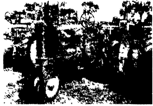
1938 John Deere Unstyled "G", New Paint, Operating Condition, Very Good Investment. Only $3,900