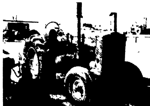
1947 John Deere Styled "D" With Starter & Lights, Runs Good, New Paint, Own A Piece Of History For Only $3,700

MILLER EQUIPMENT CO. RD 1 Bechtelsville, PA 215-845-2911