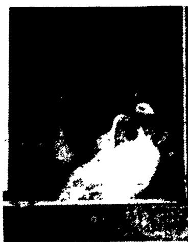
Seeing that the coast was clear, one brave gobble led the way to freedom. He wasn't going to wind up as a drumstick and gravy this Thursday.