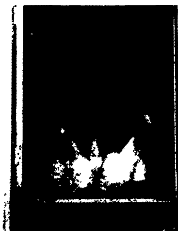
Spotting an open doorway, these turkeys at Weaver's Turkeys in Farmersville decided to make a run for it. They looked one way, then the other.