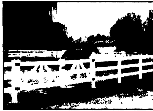
"Vinyl Horse Fence"