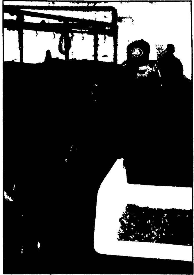
Steve Snyder feeds the high producers a PFR 18% top dress.

Top producers receive a Maximum Density PFR 18% Top Dress. Each high producer receives 6-7 lb. per day and this PFR ration is adjusted to keep intake and production at a maximum level.