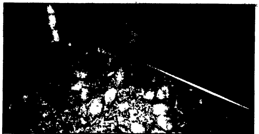
Birds Get Plenty Of Fresh Water From Start To Finish With CHORE-TIME SWISH Self-Cleaning Cups. No Supplementary Drinkers Are Needed!