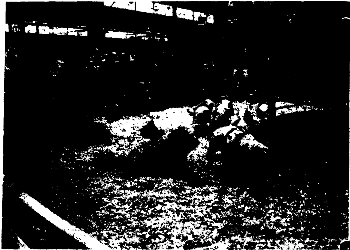
Racing pigs thrilled the audience during KILE activities held at the Farm Show complex held during October 5 to 9.