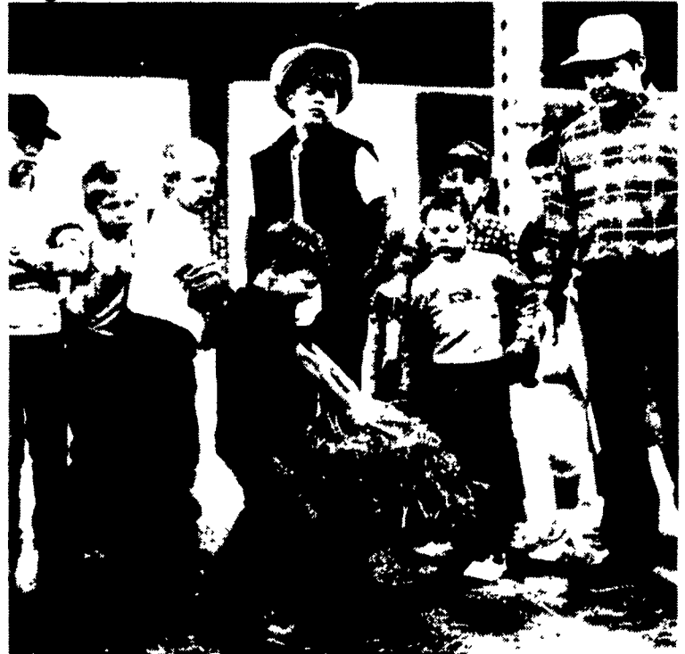
These fellows showed off their muscles during the Ag Olympic competition sponsored by Lebanon Valley National Bank at the Keystone International Livestock Exposition.