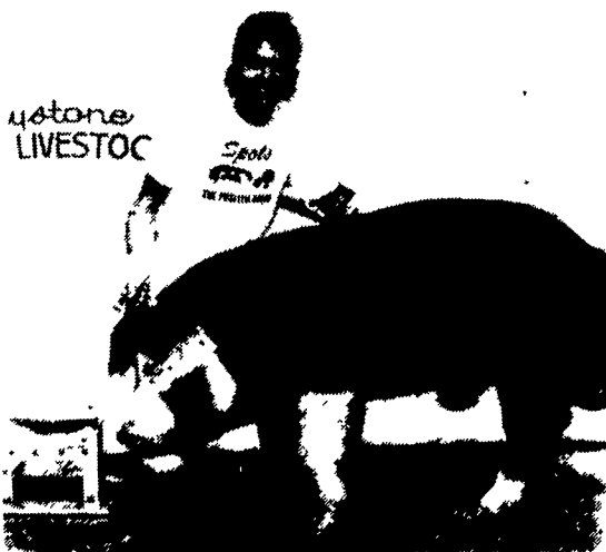
The champion Spotted boar was shown by Brian Lake of Big Cove Tannery. Lake had last year's KILE champion Spotted boar as well.