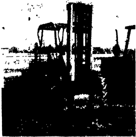
IH 5421 Forklift- 21' Mast, Side Shift, Fair Paint, Fair Operating.