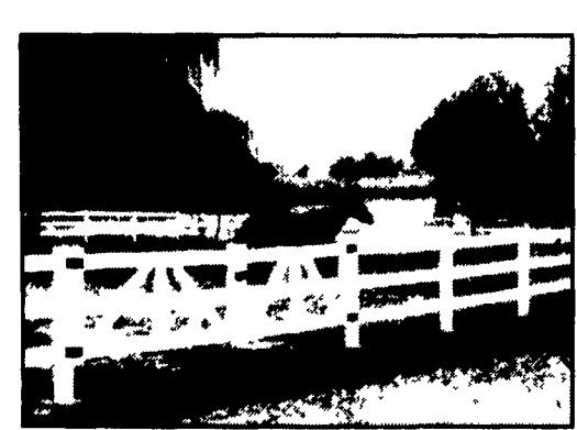
"Vinyl Horse Fence"